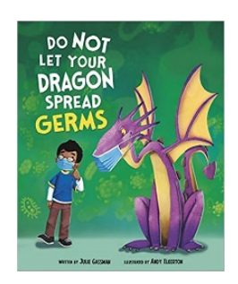
Capstone Editions, 2021