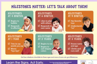
Milestones Matter Poster* (English/Spanish) *Infant, Toddler, and PS kits only