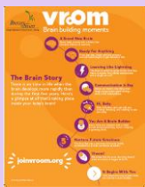
Vroom Mini Poster (English/Spanish)

Your starter kit will be customized based on the age of the children you support and whether you work in a child care center or family child care learning home. Each kit will include the following materials: