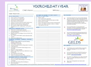
Developmental Checklist Pads (age range customized)