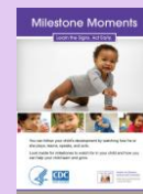
Milestones Moments Booklets (Spanish available)

To order additional copies of these and other FREE materials that support developmental monitoring, visit our e-store ( http://custompoint.rrd.com/DECAL ) or https://www.cdc.gov/ncbddd/actearly/freematerials.html . Please contact childdevelopment@decal.ga.gov if you have questions about your Starter Kit.