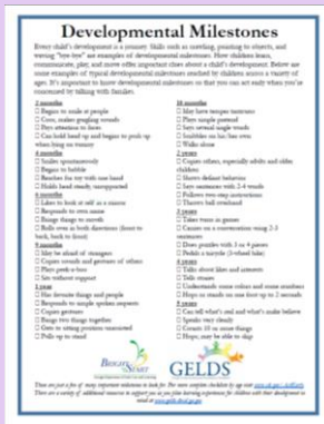
Developmental Milestones Cling